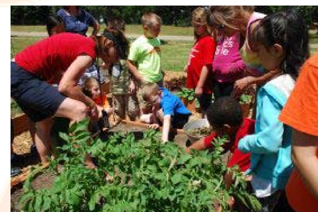
"Healthy Gardens, Healthy Youth" People's Garden School Pilot Project

Welcome to our new blog. We are working very hard on our new garden at school. We, the writers of this blog, are four 4th grade students at Hiawatha Elementary. We will be writing in different languages and taking pictures of our garden. We will be writing about how we plant and harvest vegetables from our garden.